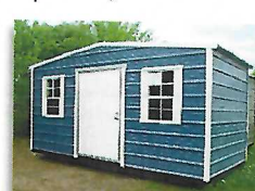
8 x 16