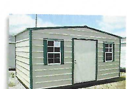
10 x 16