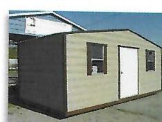
12 x 20