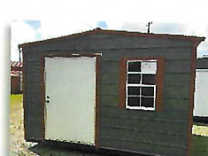
10 x 12