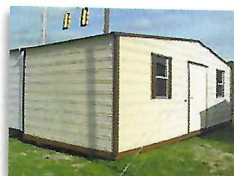
10 x 24