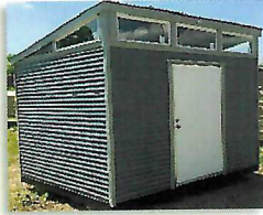
10 x 12