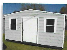
12 x 16