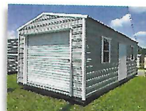
12 x 24 Garage

Great For ATV, UTV, Motorcycles And Zero Turn Lawn Mowers