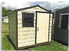
8 x 8