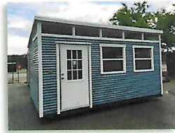
10 x 16