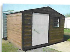
8 x 12