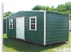
10 x 20