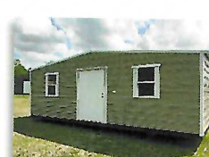
12 x 24