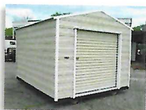
10 x 20 Utility Garage