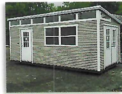
10 x 20