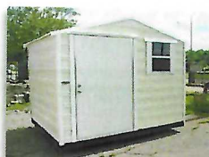
8 x 10